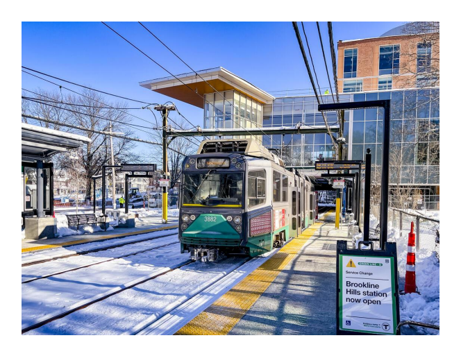
The building also coincided with the reopening of the Brookline Village MBTA stop, which runs under the site.

Totaling 120,000 square feet, this newly constructed building includes a modern library, physics labs, special education classrooms, renovated cafeteria, and a state-of-the-art "white box" theater.