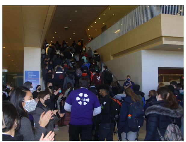
BHS and PSB staff officially welcomed students walking from 115 Greenough last Wednesday.