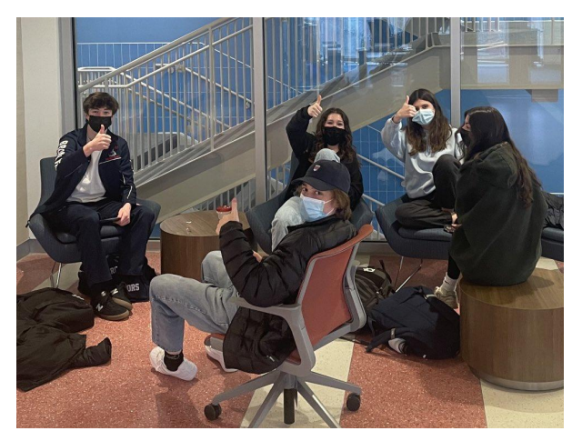
Overwhelming sentiments from students and staff? THIS IS SO NICE! Thank you Brookline!