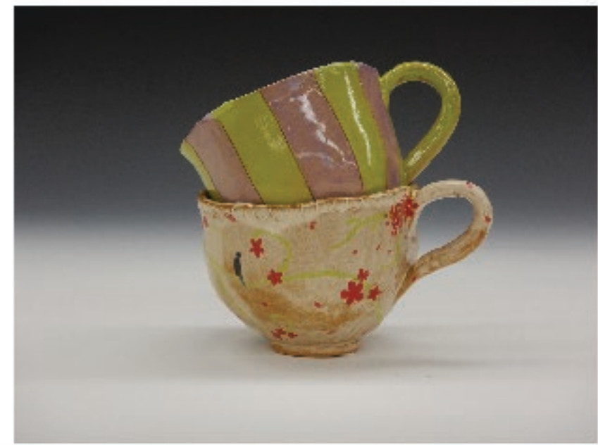
22/23 COURSE CATALOG