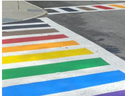
6/8: Baker Pride Walk