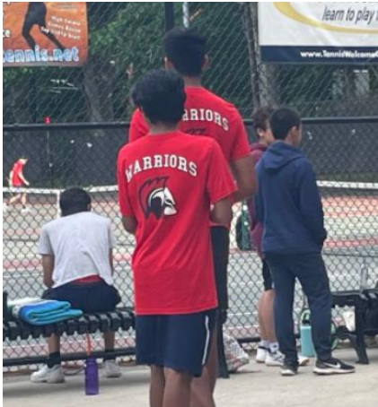
6/7: BHS Boys Tennis Match