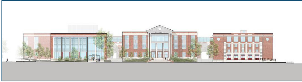
Architect rendering: Brookline High School (renovation in progress)

Recognized for excellent teachers, active parents, and high student achievement, the Public Schools of Brookline pursues its vision of an extraordinary education for every child, inclusive classrooms, pedagogical innovation and professional collaboration.