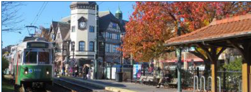
Coolidge Corner, Brookline

The Public Schools of Brookline offers its future Superintendent a unique opportunity to lead a high performing, diverse and dynamic prek-12 district holding high expectations for all. The School Committee seeks an exceptional educational leader who values community involvement and voice, who will champion and act on Brookline's commitment to educational equity and who has a track record of educational vision as well as outstanding interpersonal and managerial skills.